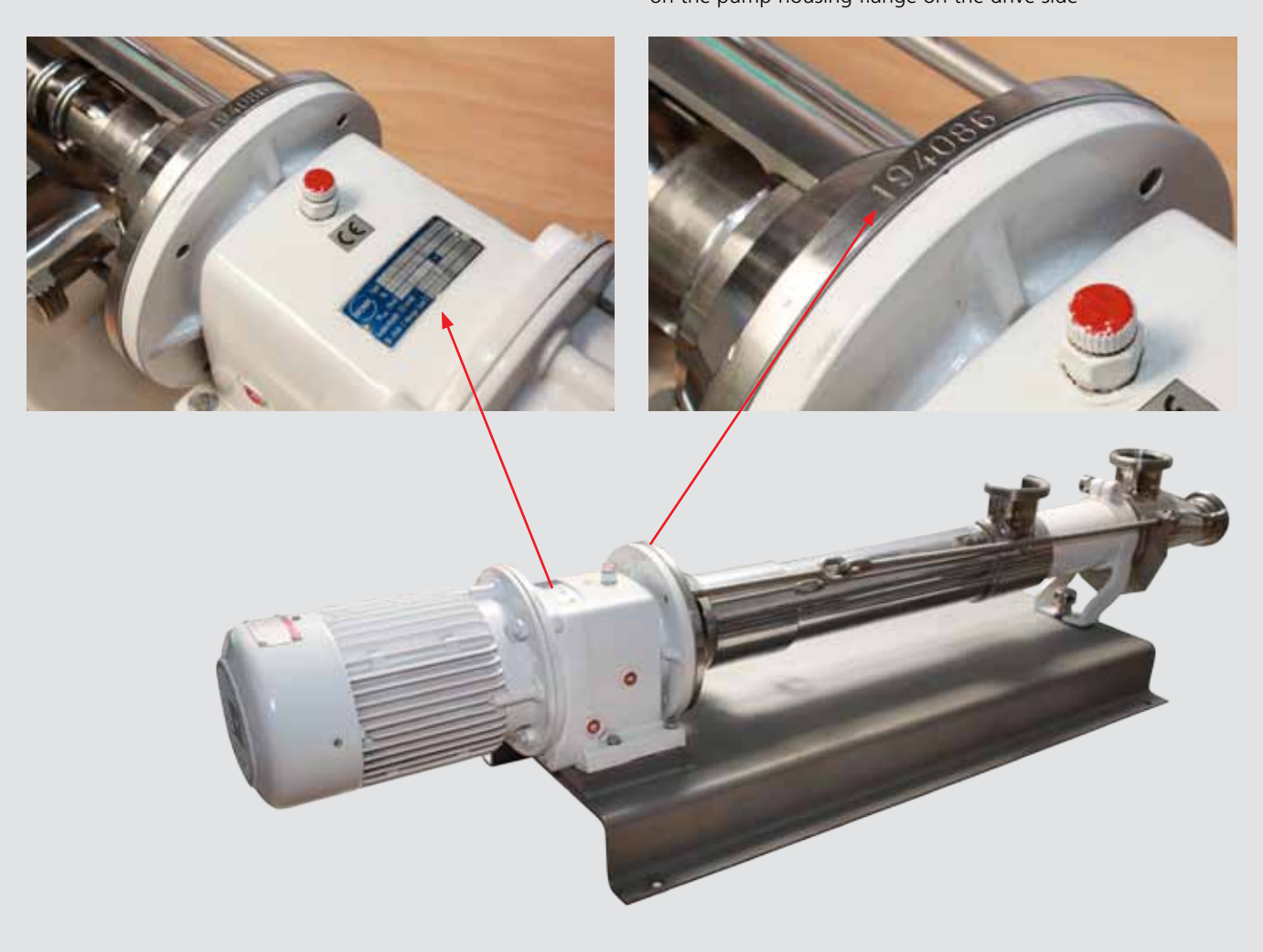
Serial ID number on the pump housing flange on the drive side