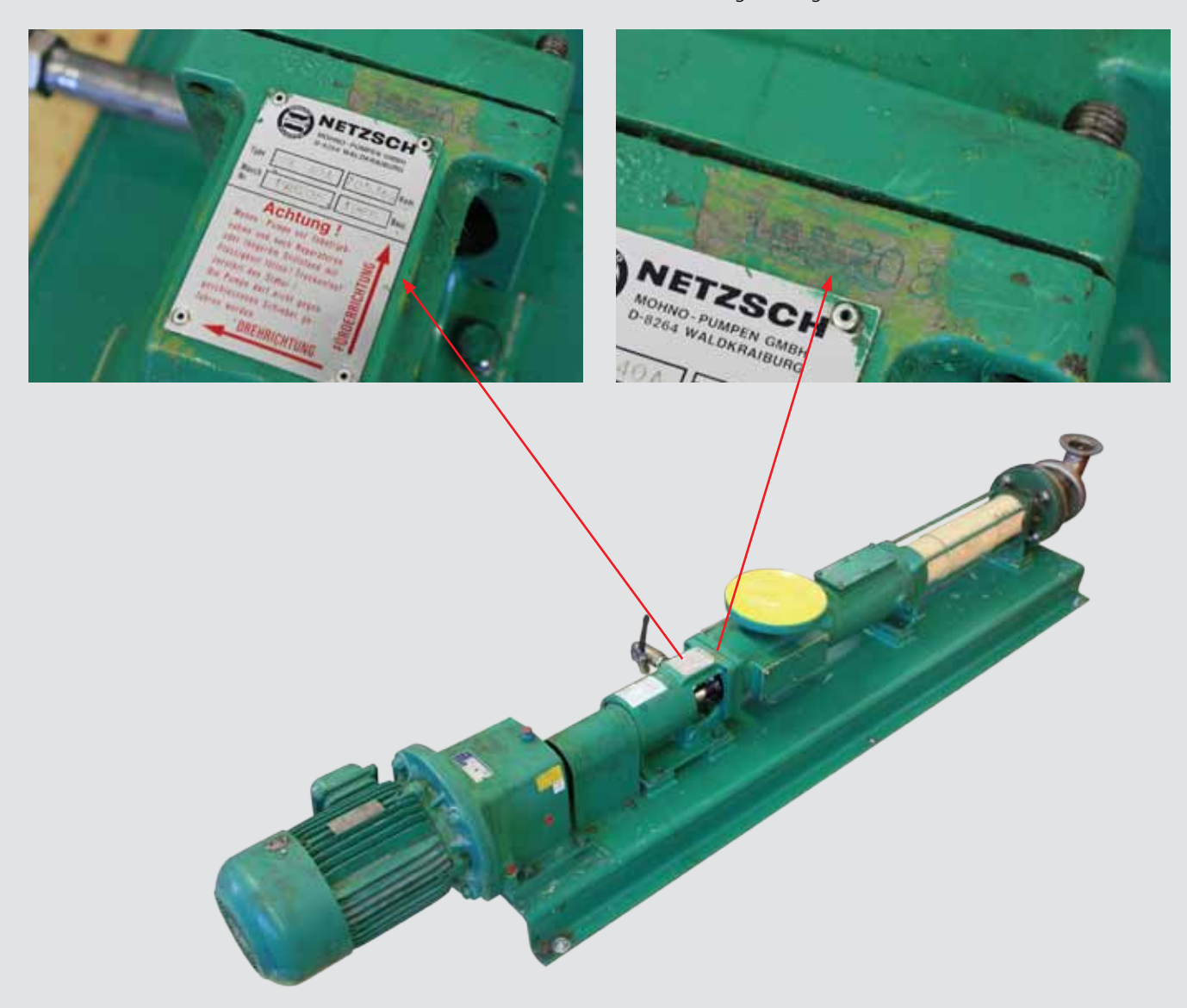
Serial ID number at the top on the bearing housing